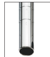
Post for Stem Caster