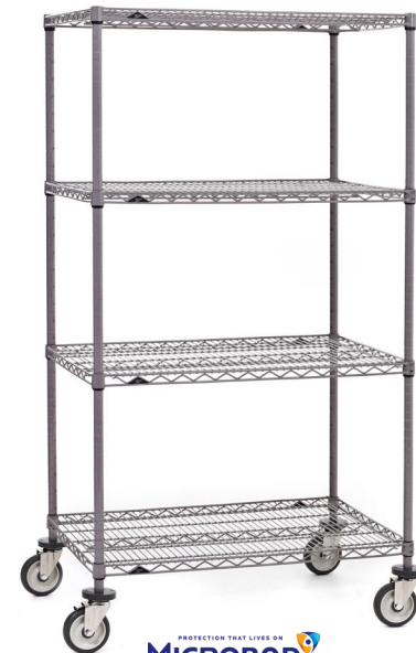
Super Erecta with Metroseal