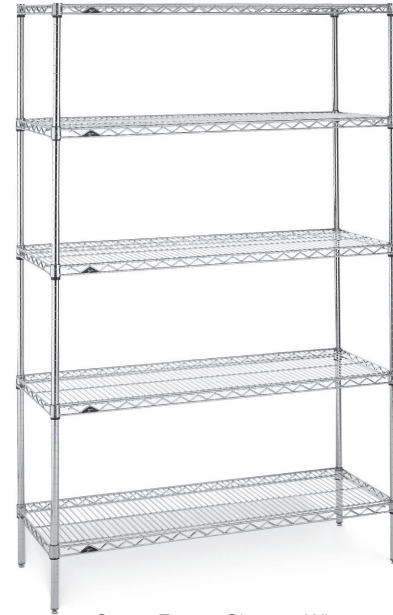
Super Erecta Chrome Wire

Note: Stainless stationary posts are equipped with stainless steel leveling feet.