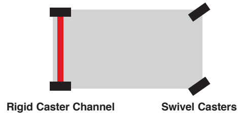
Rigid Caster Channel