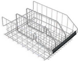
IVB1 (Dividers sold separately)