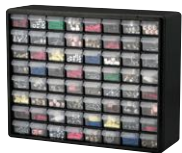
10164 64 Small Drawer Cabinet

*Dividers are molded into the back of the cabinet. Remove with scissors. Additional dividers sold separately.