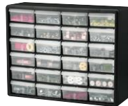
10124 24 Large Drawer Cabinet