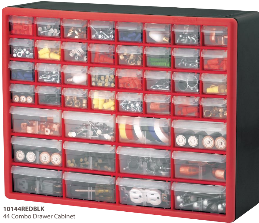
10144REDBLK 44 Combo Drawer Cabinet