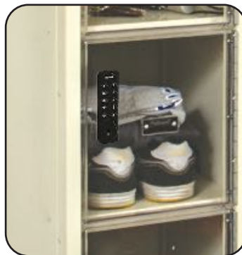
Clear Polycarbonate Doors Provide View of Locker Contents