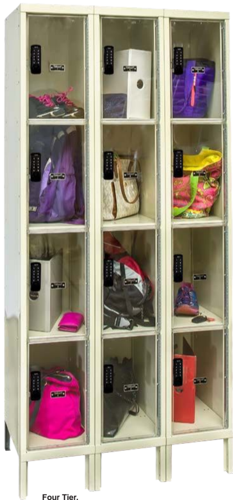
Four Tier, 3 wide, 12 openings