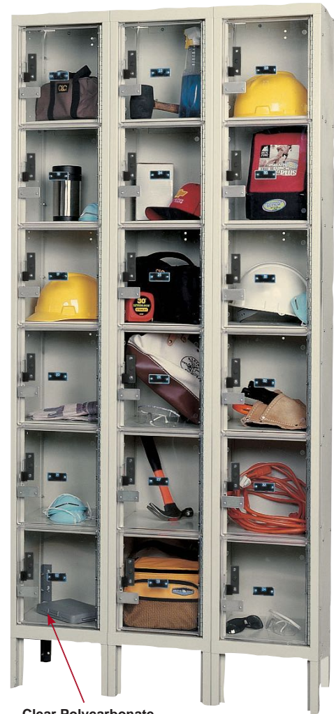
Clear Polycarbonate Doors

All box door finger pulls are made of a super tough nylon material which includes an Antimicrobial agent offering protection against the growth of molds and bacteria.