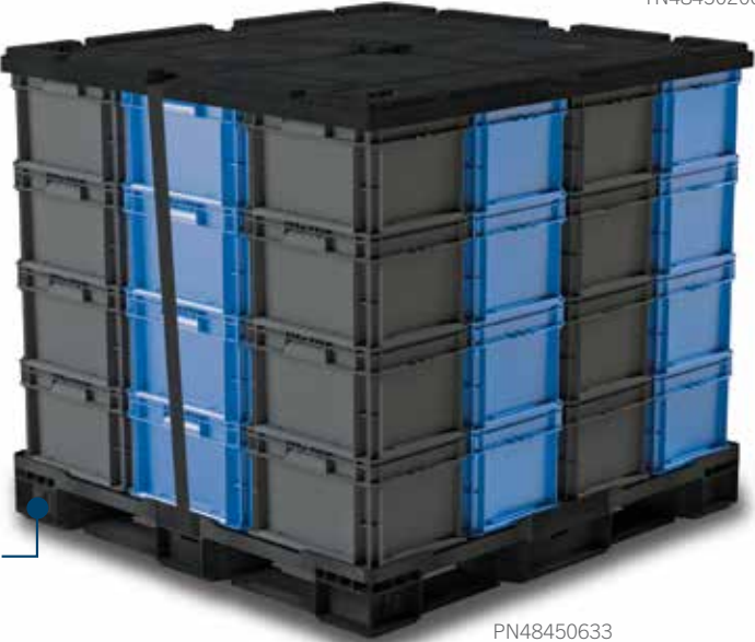
Optimum Configuration Containers cube 48" x 45" pallets