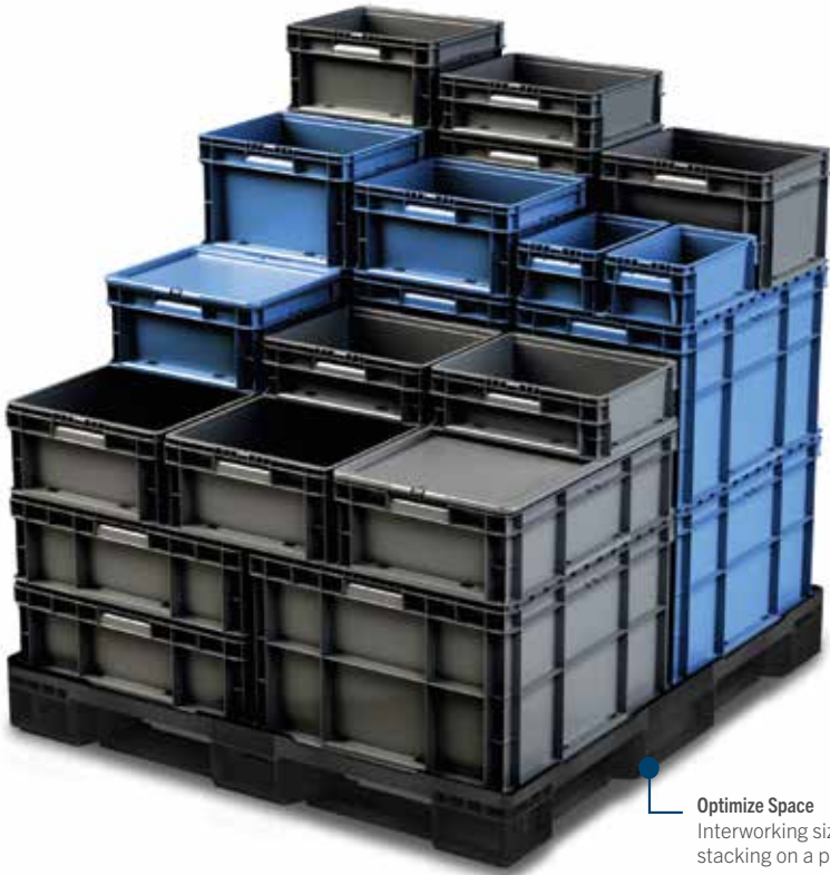
Optimize Space Interworking sizes allow mixed stacking on a pallet