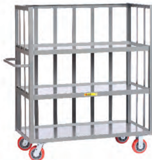
Adjustable Shelf S3L-2448-6PPY