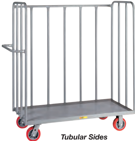
Tubular Sides OTL-2436-6PPY