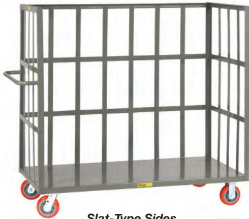
Slat-Type Sides S1-2448-6PPY