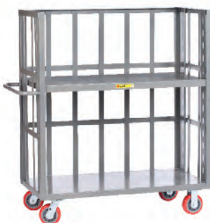
Adjustable Shelf S2-A-2448-6PPY