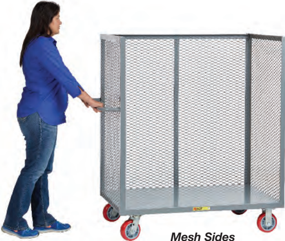
Mesh Sides T1-2448-6PY