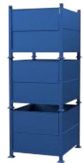
STACKED 3 HIGH FOR TRUCK SHIPMENT