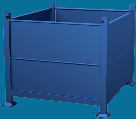
Standard Blue Enamel Finish