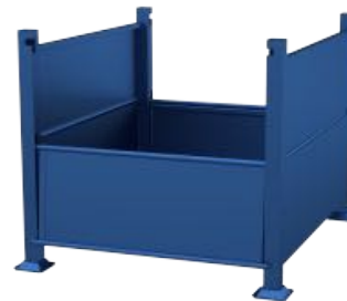
2 GATES OPEN