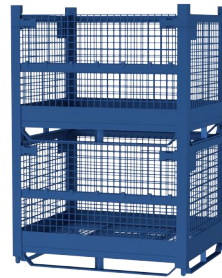
STACKED 2 HIGH FOR 50 FULL TRUCKLOAD SHIPMENT