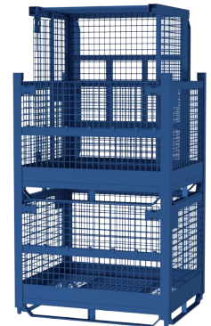
STACKED 3 HIGH FOR 75 FULL TRUCKLOAD SHIPMENT