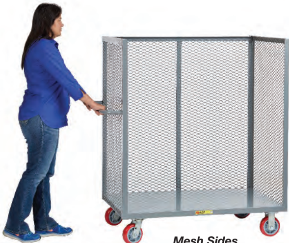
Mesh Sides T1-2448-6PY