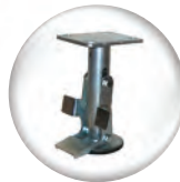
Optional Floor Lock