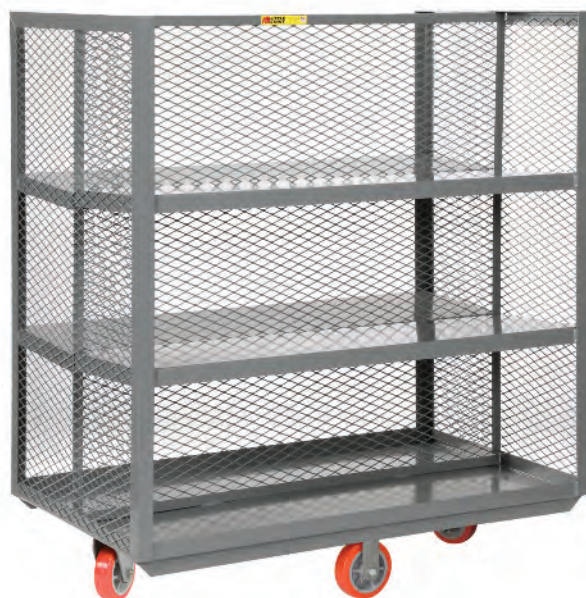
Shelf in raised position

Release slide bolts to drop upper shelf down and out of the way