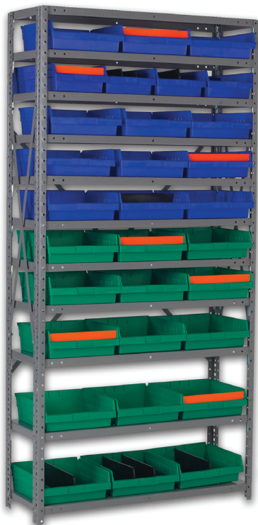
M1236-13 Metal Shelf, SB1211-4 and SB188-4 bins with Kanban System