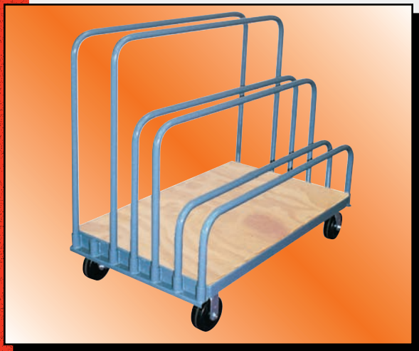
Model PO Shown