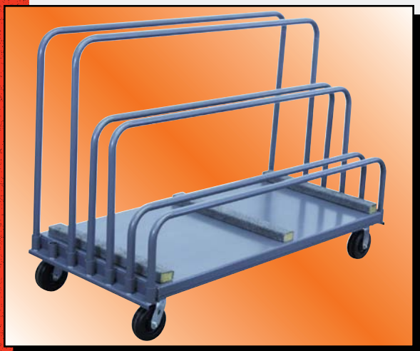
Model TE Shown