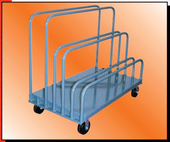
Model PG Shown