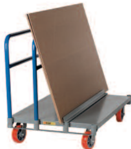
Shown with Optional Lip Attachment