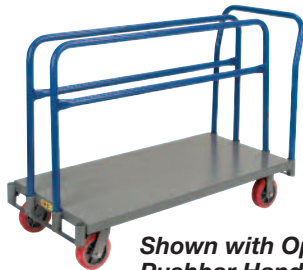
Shown with Optional Pushbar Handle