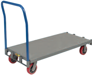
Shown with Optional Pushbar Handle (and without supplied Uprights)