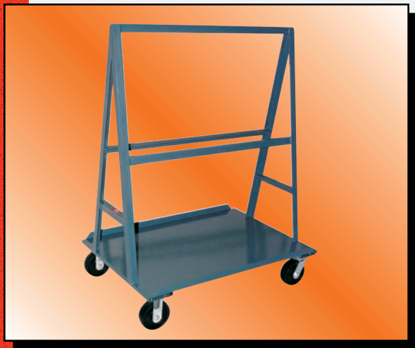
Model PC Shown

4,000 LB CAP.* (*2,400 lb with R8 - 3,800 lb with U8)