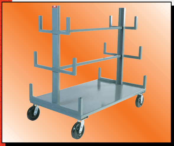
Model TP Shown

4,000 LB CAP.* (*2,400 lb with R8 - 3,800 lb with U8)