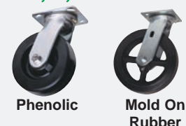
Phenolic Mold On Rubber