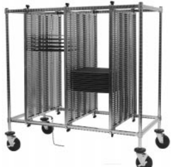
Benchside Model with Optional Center Panel

Distributed By: Custom Equipment Company 866-333-0728 919-847-5765 fax tom@custommhs.com www.custommhs.com