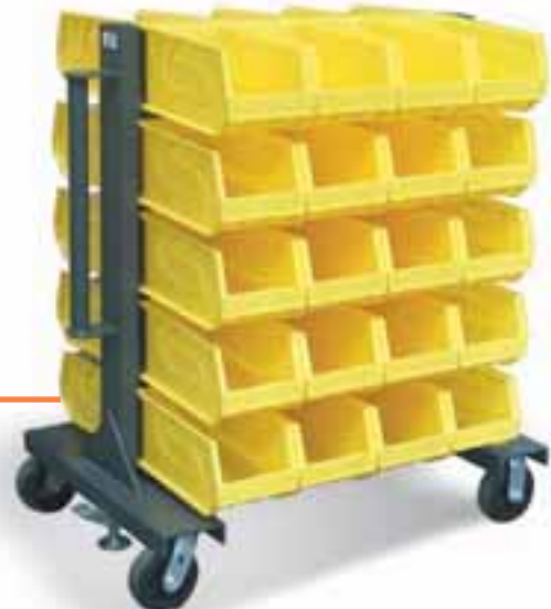
Product Number... 3.33.2-BR-40CA Width x Depth x Height...37" x 28" x 40" Overall Height...48" Number of Bins...40 Weight...257 lbs.

Transport small parts with this bin cart. It measures 37" wide x 28" deep x 40" high, with the overall height 48". It contains 40 plastic bins, 8 1/4" w x 14 3/4" deep x 7" high that hold up to 60 lbs each. There are 2 swivel 6" x 2" mold casters and 2 rigid mold on rubber casters with a 6" floor lock. The handle is located on the side for ease in steering.