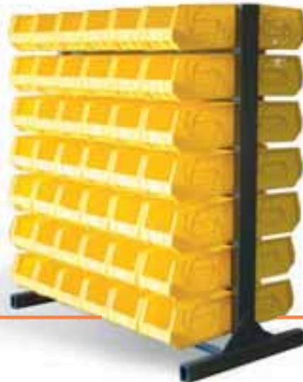
Product Number... 55-BR-84 Width x Depth x Height... 55" x 28" x 60" Number of Large Bins...84 Weight...382 lbs.

These bin storage units are made from 12-gauge hangers and 4" channel uprights. The bin contents are visible and easily accessible. These units are ideal for organizing small parts in shops, factory assembly areas, parts departments and maintenance tool cribs. The yellow bins are 8 1/4" wide x 14 3/4" deep x 7" high and hold up to 60 lbs.