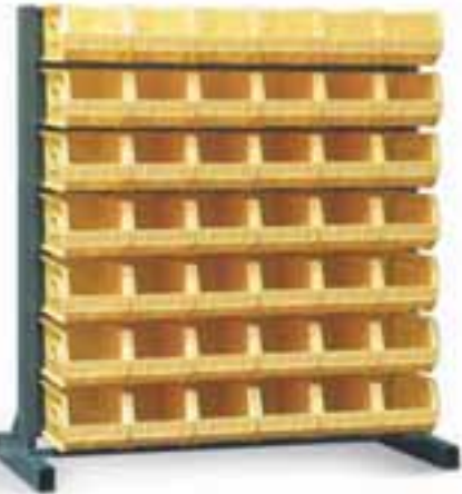
Product Number... 55-BR-42 Width x Depth x Height... 55" x 28" x 60" Number of Large Bins...42 Weight...205 lbs.