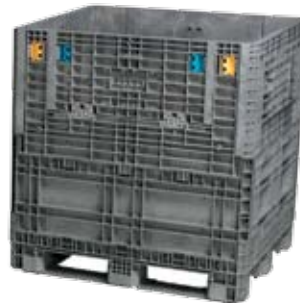
BI484550 w/ 2 Drop Doors