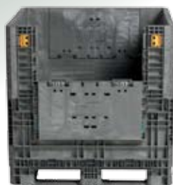
BI484548 w/ 2 Drop Doors