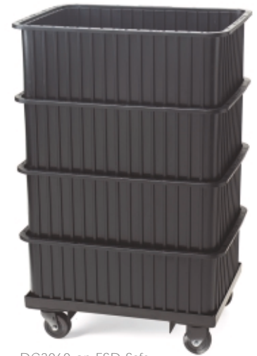
DC3060 on ESD-Safe DDC3000-CON Dolly

* Available on a make-to-order basis. Please call for more information.